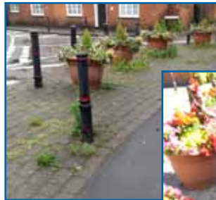
Before and after the FODS gardening group got to work

It would be remiss of us not to mention, the volunteers of the FODS gardening group who turn out each weekend, weeding and tidying the village and who have played an important part in our campaign to win an award for