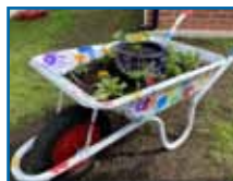
(left) Woody enjoying the performance, and (above) the infant school barrow planted up

We are currently working on a big project to develop our outdoor wildlife and pond area at the junior school. The Parish Council has kindly donated £6000 to the project. The plans hopefully will include: an outdoor shelter/classroom, bird-feeding station, pond dipping platform, spiritual area with prayer pool and pergola, willow