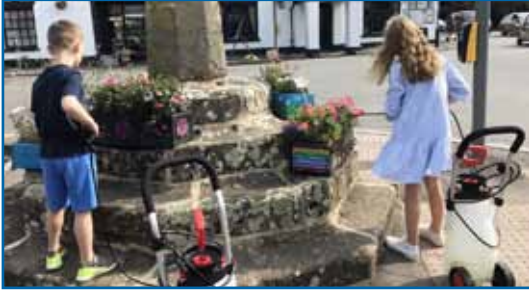
'Water Warriors' using the mobile bowsers bought with funds from the Parish Council

article submitted in this issue by the Allotment Association certainly resonates as we battled with extreme contrasts in the weather.