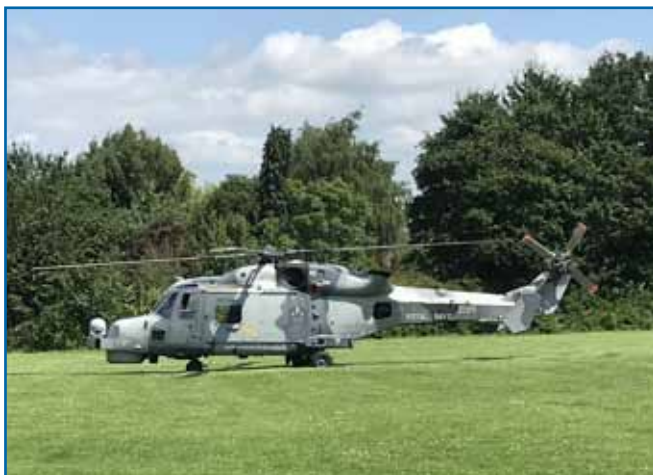
The aircraft is a Royal Navy Wildcat Maritime Attack Helicopter