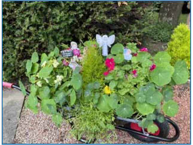
St Peter's wheelbarrow planted up in support of Dunchurch in Bloom

We have a statement on our notice board which welcomes people in all