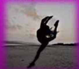
SCSD Owner

Ballet, Tap & Disco/Street Dance Classes for children & Teenagers (Pre-school Ballet from age 2)